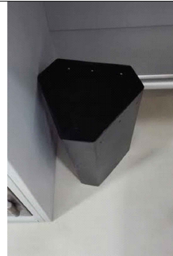
PAPELERA METALICA PARA PERSONAL (Imagen referencial)